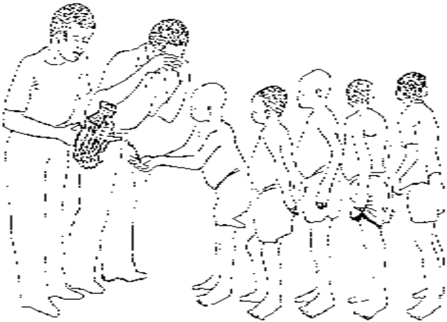
This picture shows demonstration in a school of face washing in the prevention of trachoma.